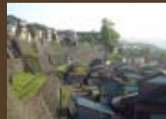
3 Yatsuo Town (2004-)