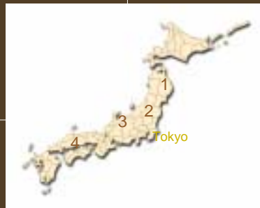
4 Tomo Town (2000-)