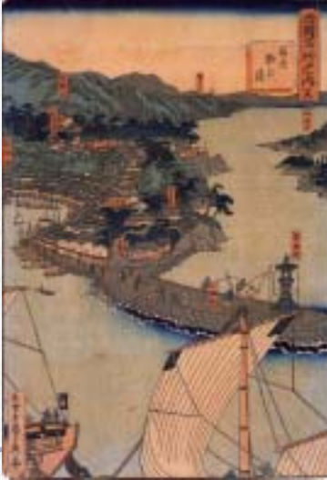
drawing of TOMO at the EDO era