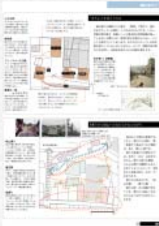
Inside TOMO magazine 2001