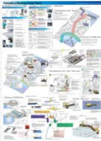
Towards a Hosting Portal Town(2003)