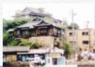
Office for administrator of harbor in old days