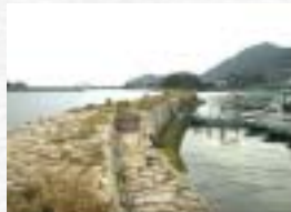
Bank for erasing waves