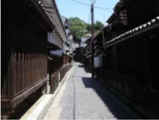
The historical city-center