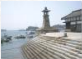
Stairs for easy access to sea