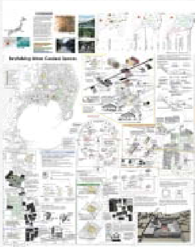
Revitalizing Urban Coreless Spaces(2001)