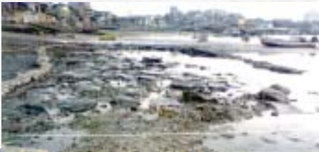
Place for repairing ships