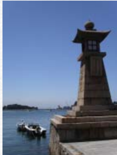
Tomo has developed as a harbor