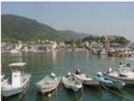
View from the sea