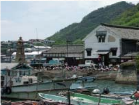
TOMO locates at Fukuyama city, Hiroshima pref.