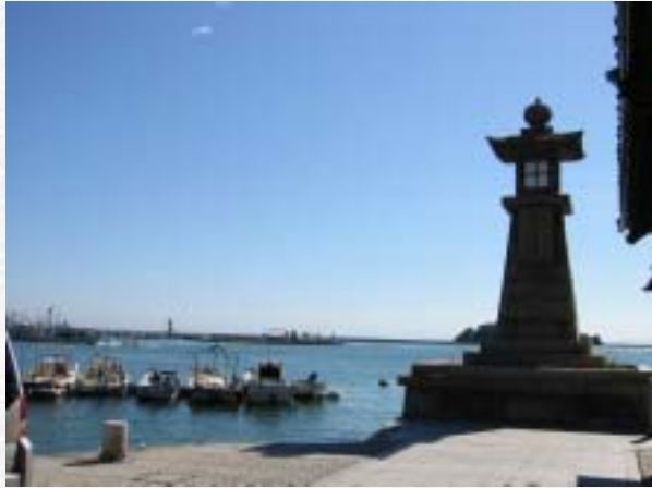
Urban Design Lab. at the University of Tokyo